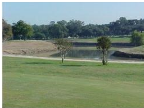
6th Hole Fairway (Brays Bayou)