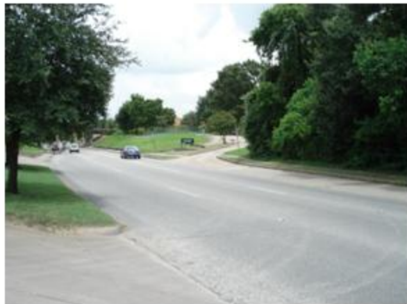
Existing main entrance down Wayside