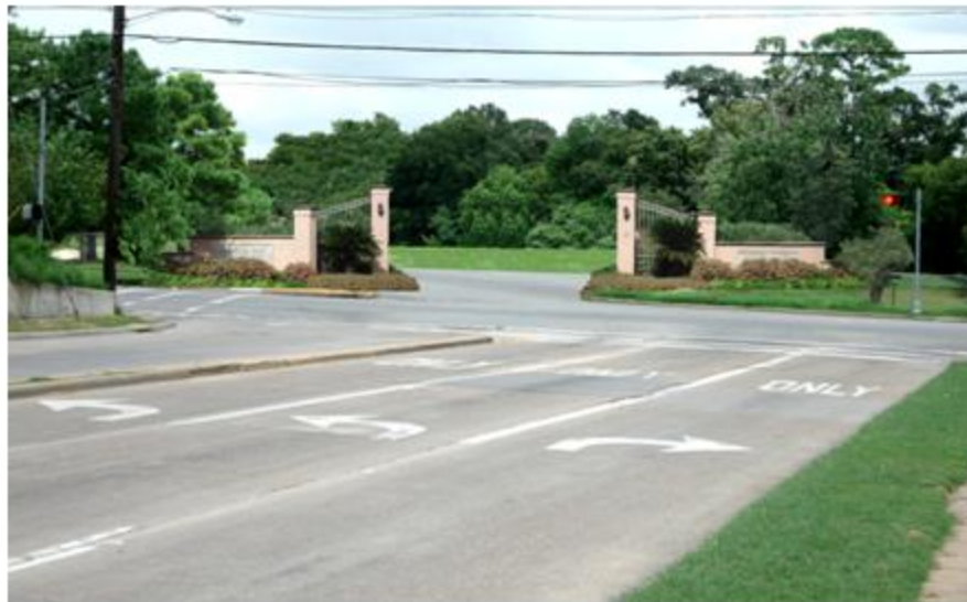
Proposed main entrance