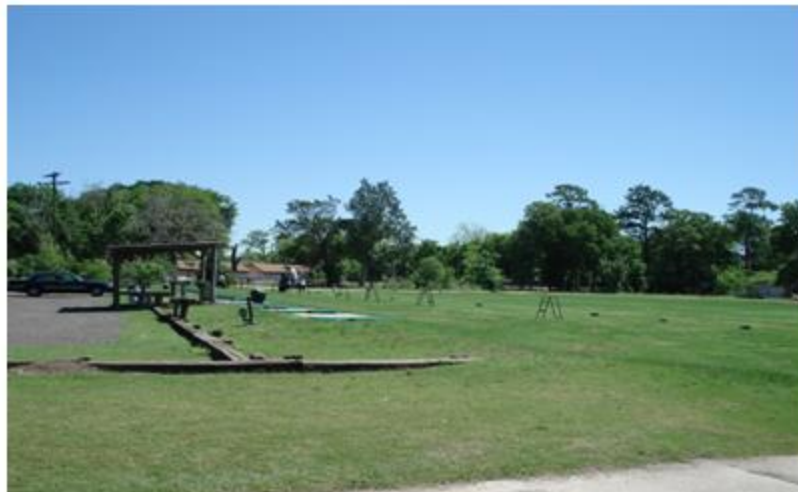
Existing practice range