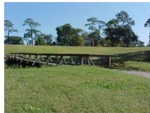
Bridge to the 7th Hole Green