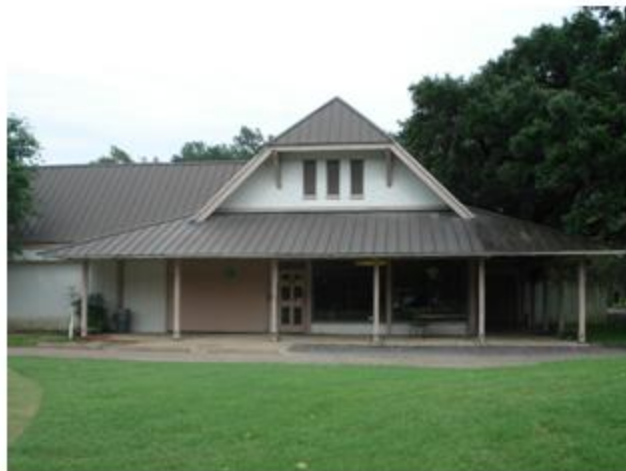
Gus Wortham GC club house