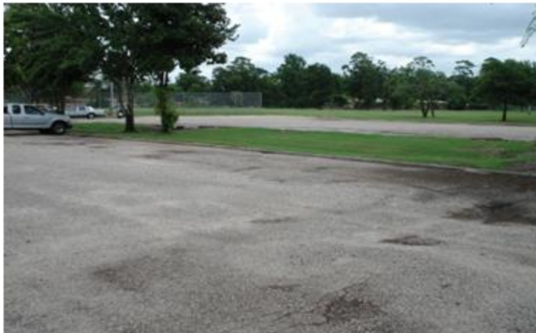
Existing parking area