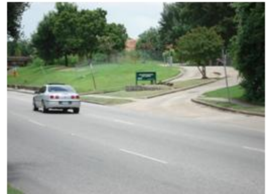
Existing main entrance