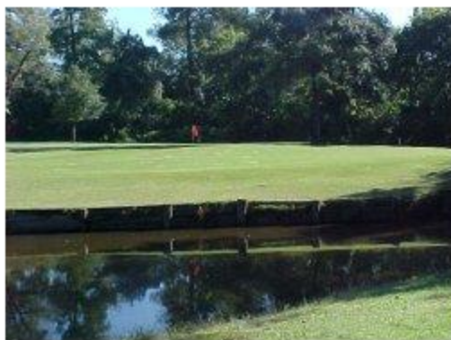
View to 8th Hole Green