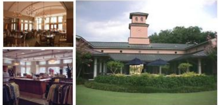
Memorial GC club house