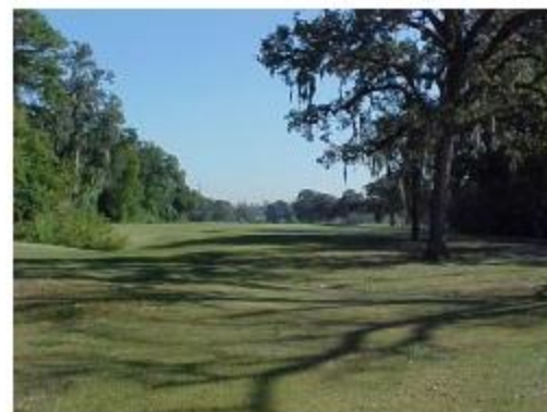
View from 17th Hole Fairway