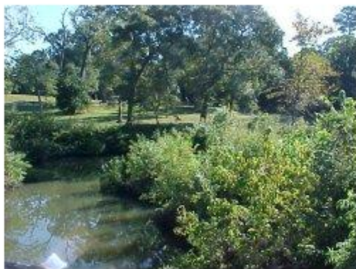
View from 2 nd hole tee