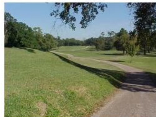
View from the 18th Hole Tee